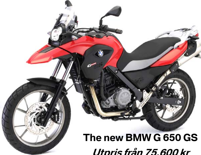
The new BMW G 650 GS Utpris från 75.600 kr